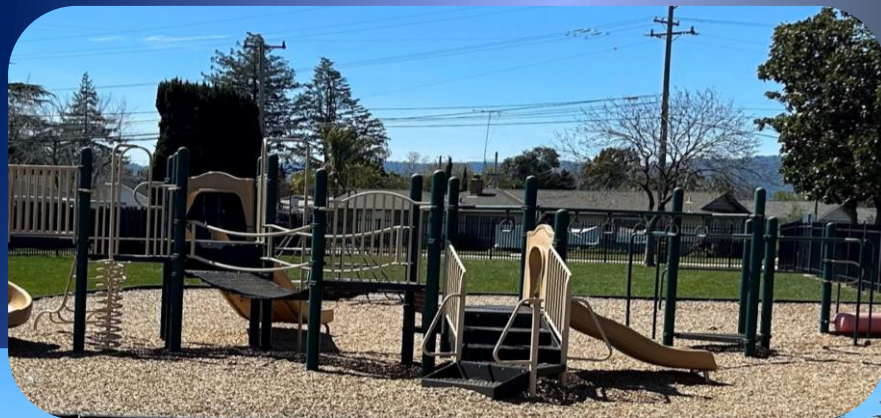
Playground in the front of the school: Repair