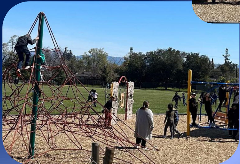
Playground in the back of the school near the field: Repair