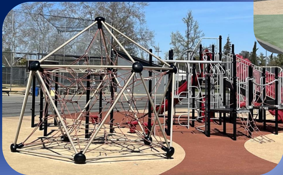
Playground near the field: Repair