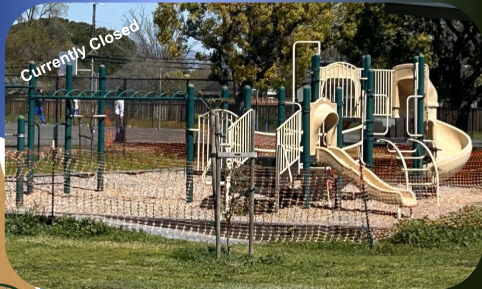
Playground in the back of the school near the blacktop: Replacement