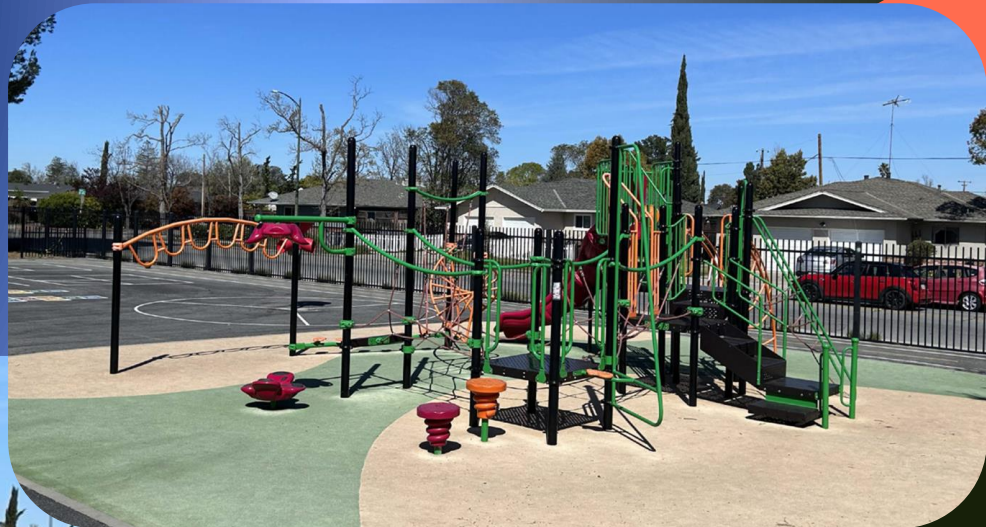
Playground near Foxworthy: Repair