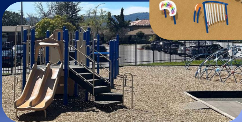
Playground in the front of the school: Repair