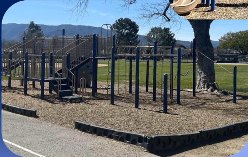
Playground near rooms 16 -21: Repair