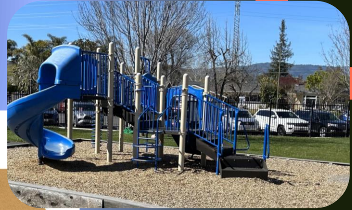
Playground in the front of the school: Replacement