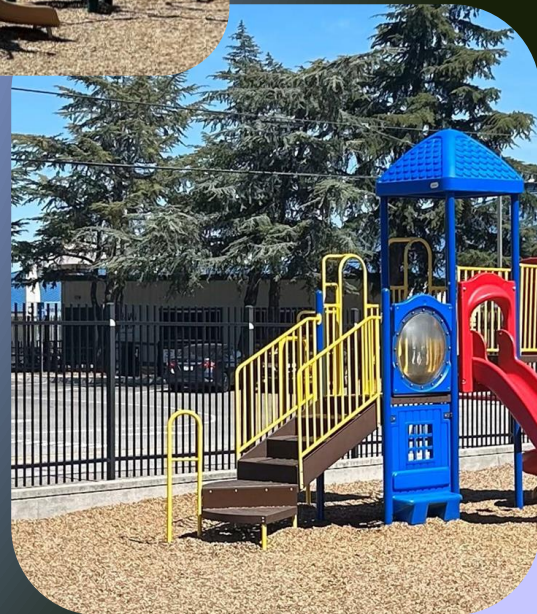
Playground near Price: Additional areas of play