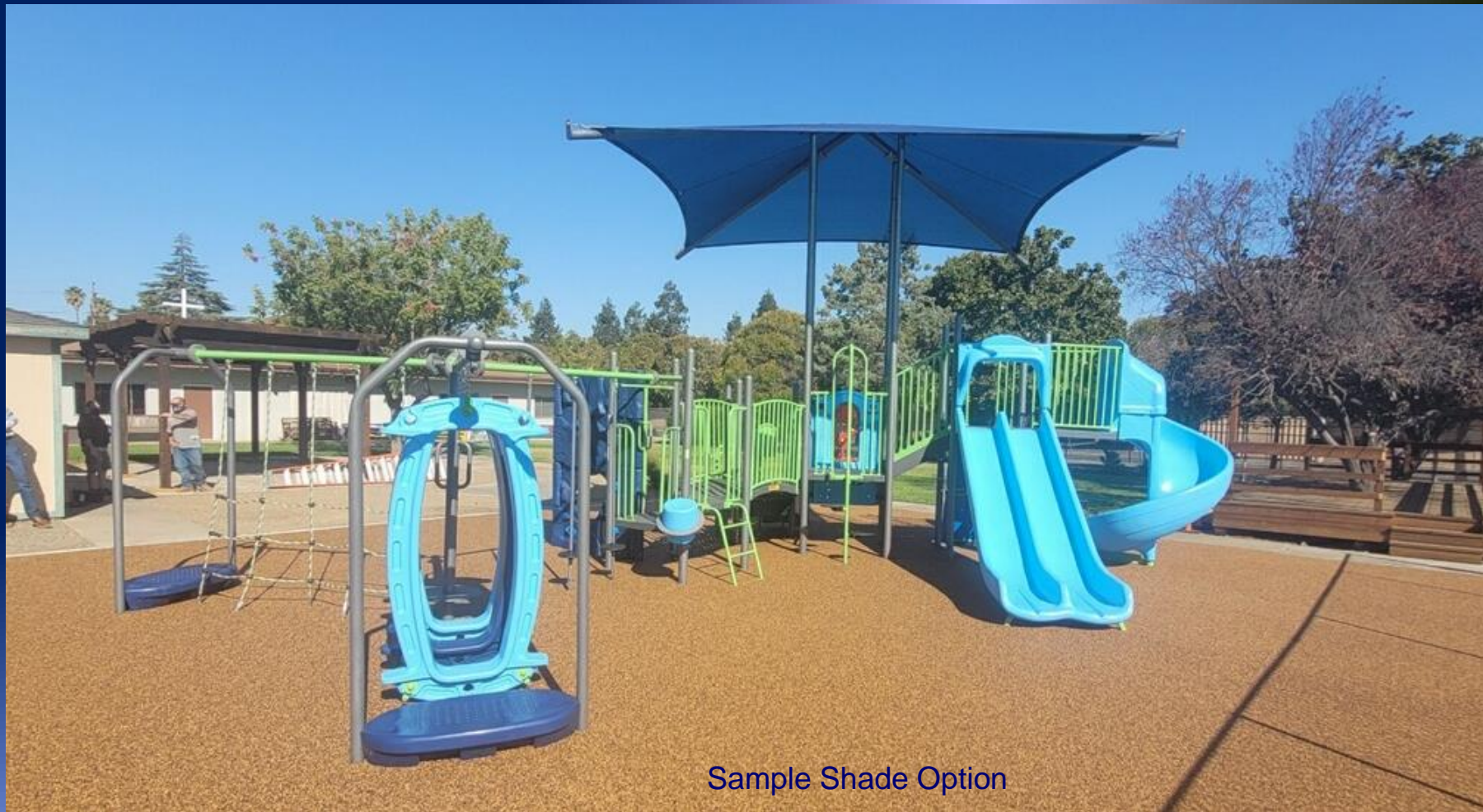
Sample Shade Option