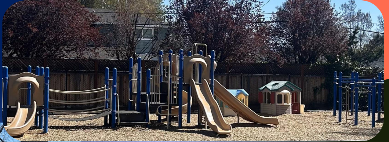
Kindergarten Playground near rooms K1 & K2: Repair and additional areas of play