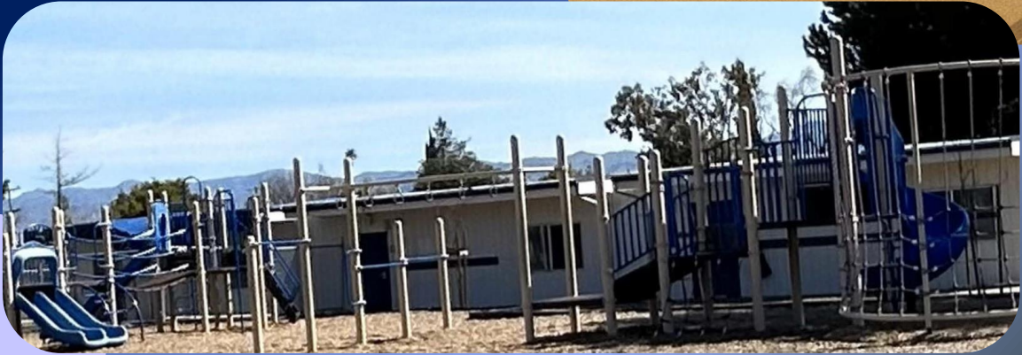
Playground in the back of the school: Repair