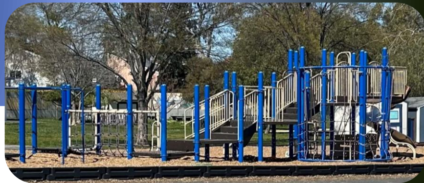
Playground on the side of the school: Replacement