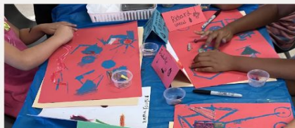
Units of Study

Creating and producing art is central to the human experience. Art allows people to feel and express the range of human emotions, art connects people to one another and to their local and global communities. For many, an arts education is only the beginning of a lifelong appreciation and enduring sensitivity to the way the arts enrich lives. Join us on our adventure to renew a formal arts education in CSD.