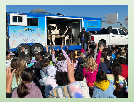
Dairy Cow Assembly