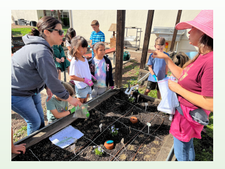
Gardening with 1st grade