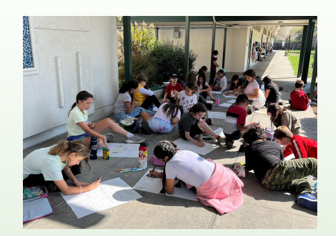
Lunch time poster making