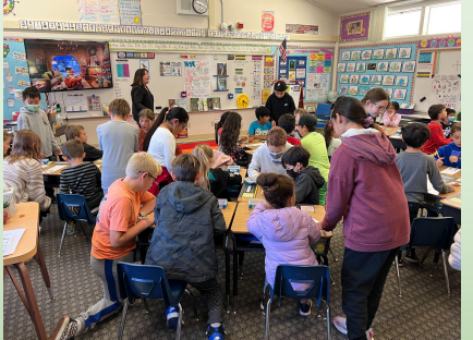
Second and Fifth Grade Buddies