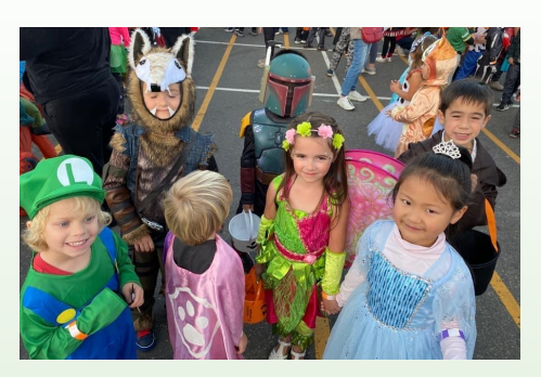
Return of the Monster Boogie Bash